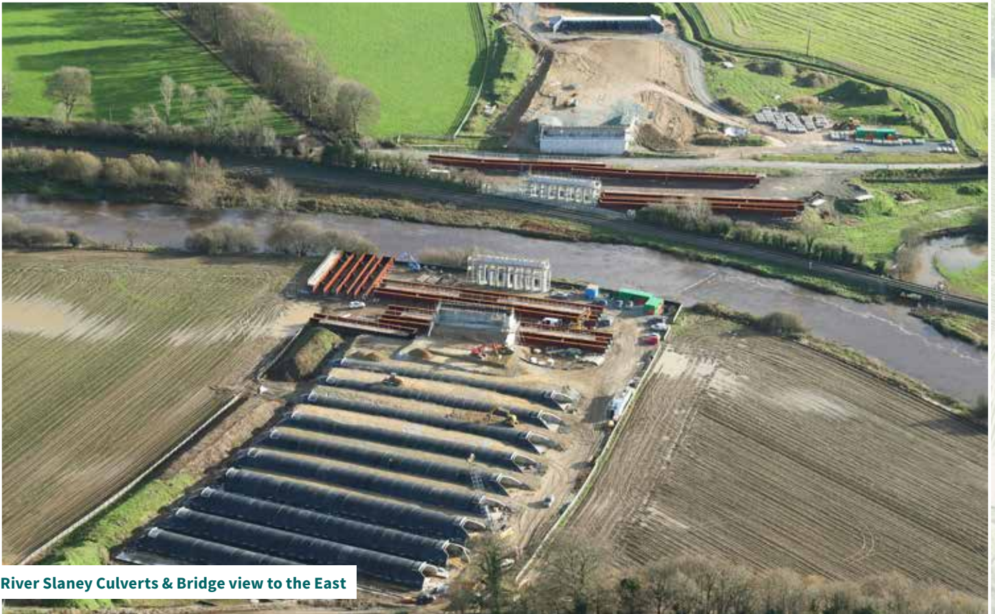
River Slaney Culverts & Bridge view to the East