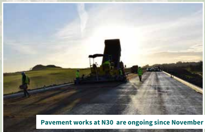
Pavement works at N30 are ongoing since November