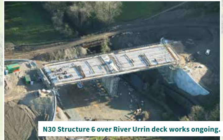
N30 Structure 6 over River Urrin deck works ongoing.

On the West Side of the river the installation of 10 new flood relief Culvert arches has been completed. The area is prone to flooding during the winter months so our design team has proposed the installation of these culverts at this flood plain in accordance with the Environmental Impact Statement. The 10 culverts have a total length of 670m. Banagher Precast has fabricated the arches at their facilities in Ireland, and they delivered them to our site last September.