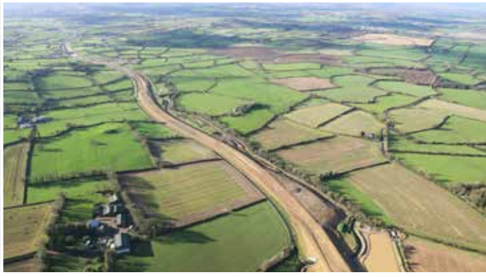
M11 North alignment looking South. Ready for pavement works.