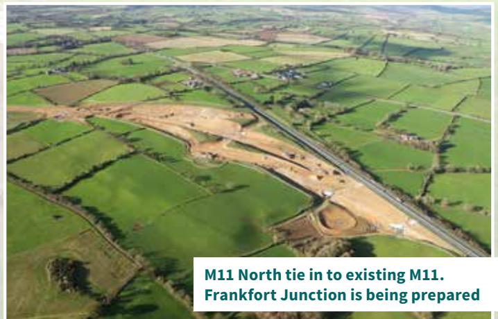
M11 North tie in to existing M11. Frankfort Junction is being prepared

For the bridge over the River Urrin beams have been installed before Christmas and the deck works are ongoing with a target to have the structure completed by the end of the first quarter of 2018.