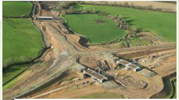
M11 Ballydawmore Junction & Bridges looking west to N80.