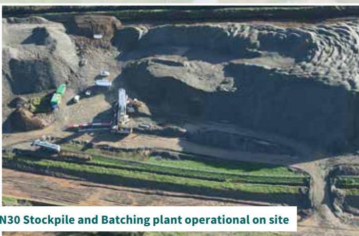
N30 Stockpile and Batching plant operational on site

For the bridge over the River Urrin beams have been installed before Christmas and the deck works are ongoing with a target to have the structure completed by the end of the first quarter of 2018.