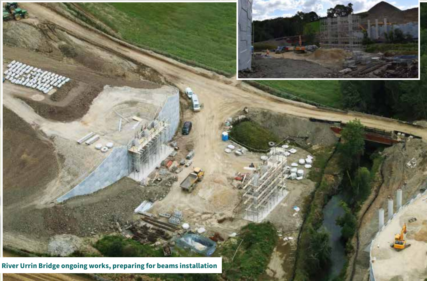
River Urrin Bridge ongoing works, preparing for beams installation