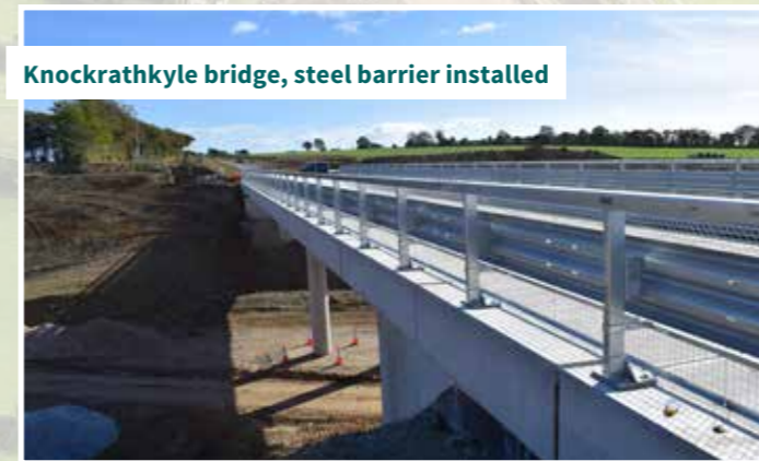
Knockrathkyle bridge, steel barrier installed