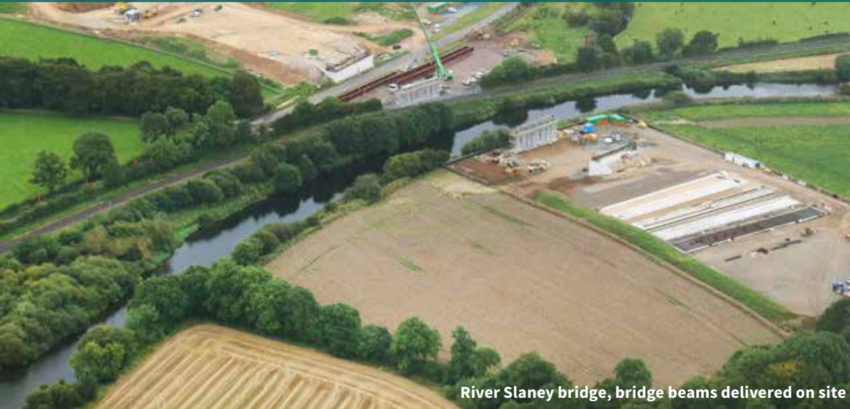
River Slaney bridge, bridge beams delivered on site