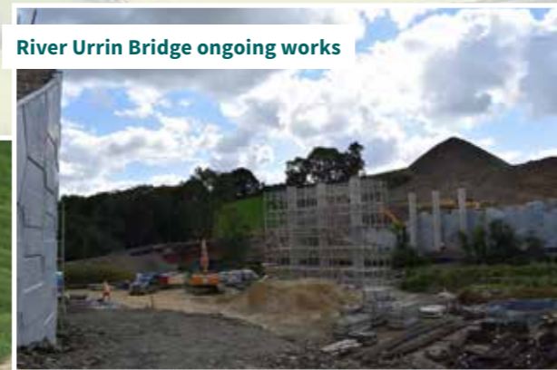
River Urrin Bridge ongoing works