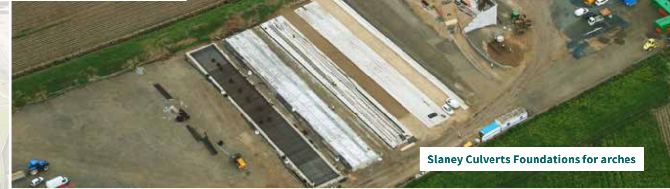
Slaney Culverts Foundations for arches